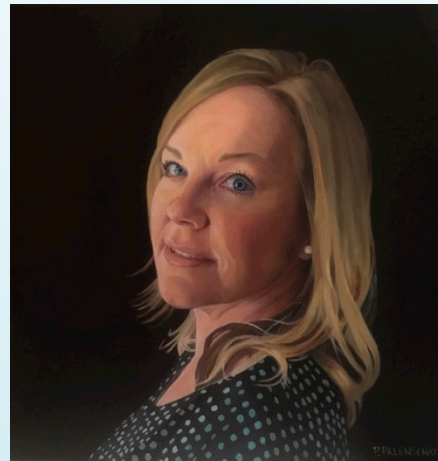
Another Girl With a Pearl Earring