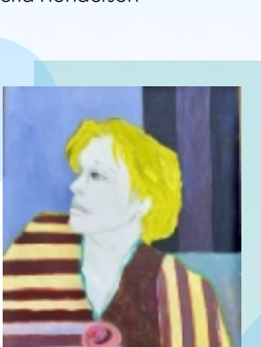
"Hiding in Plain Sight" by Roberta Dyer