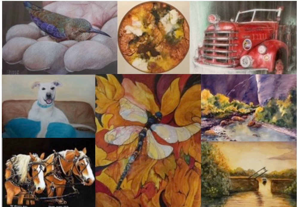
Amazing artwork from some of our Octogenarians

OCTOGENARIAN \ˈɒk-tə-jə-ˈner-ē-ən\ noun 1. A chronologically gifted person whose age is in the eighties. see also: venerable, sagacious, experienced, award-winning, talented! The octogenarians create beautiful artwork that inspires everyone.