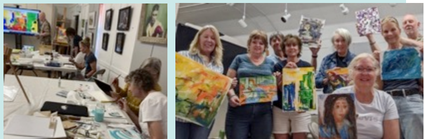
Abstract Workshop on June 21