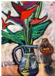
Sketch by Sarah Sullivan

Below are some of images of Sarah's beautiful work. The first image is a sketch she will use at her demo.