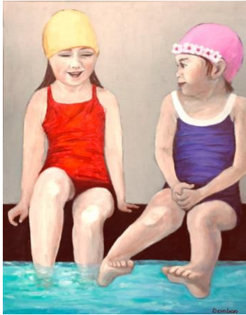
Swim Class