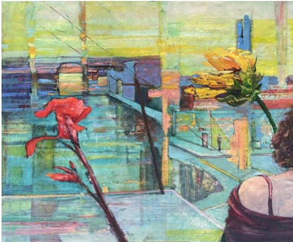
The Light by Elizabeth Washburn