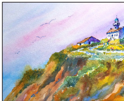
Cabrillo Lighthouse