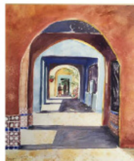
The Shaded Sidewalks of El Cajon