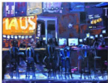
Nightcap at the Coinhaus Bar, La Mesa