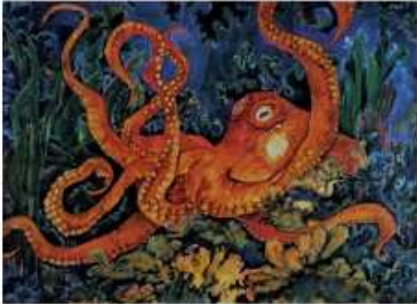
2020 First Place "Inky" By Dottie Hayes