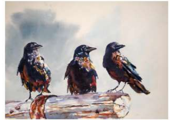
"Crows in a Row"