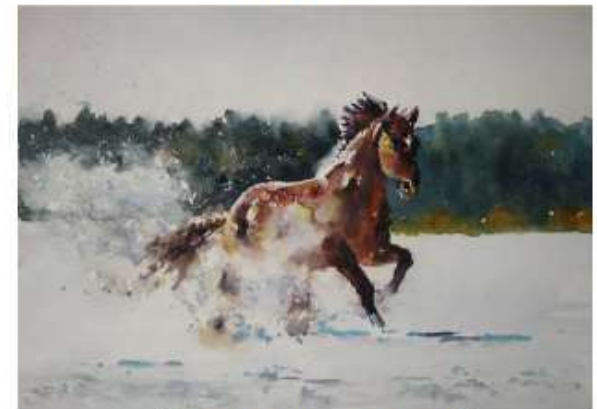
"Running Horse in Snow"