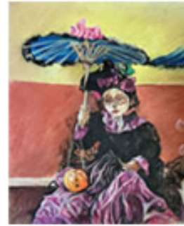
Catrina with Parasol