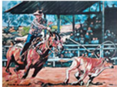
Lakeside Rodeo Calf Roping