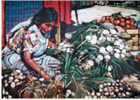
Oaxaca Onion Market