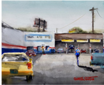
Trust Auto Repair