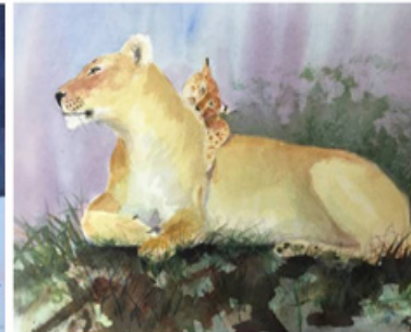
Play Time by Gloria Chadwick