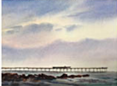
OB Pacific by Drew Bandish 2nd Place