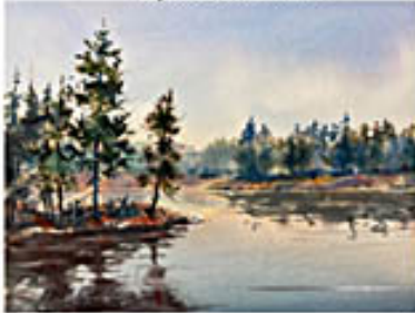
Shoreline Pines by Drew Bandish