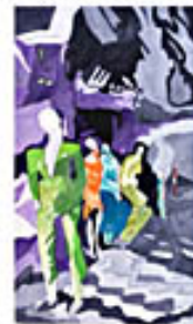
Incognito by Roz Oserin