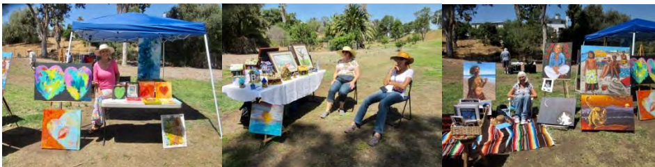
Shown above are pictures from the Foothills “Art in the Park: Show & Sale” at La Mesa’s MacArthur Park on Sunday, June 10 th . Twenty-four artists exhibited and sold their artwork to a flow of visitors, family, and friends.