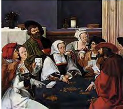
“Card Players” by Lucas van Leyden, c. 1508.

Excerpted from Wikipedia, the free encyclopedia