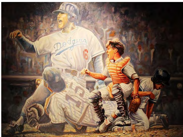
October Demonstrating Artist

Small Image Show Reception 2:00 – 4:00 pm